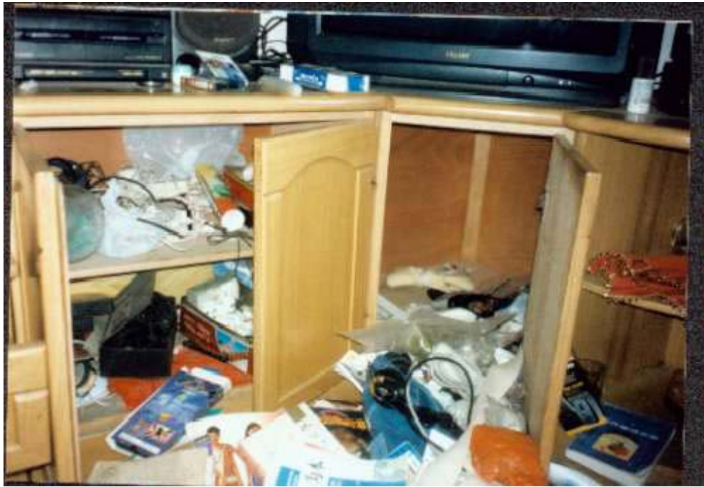
Figure 7: A Practitioner's Home After Being Ransacked by Chinese Police