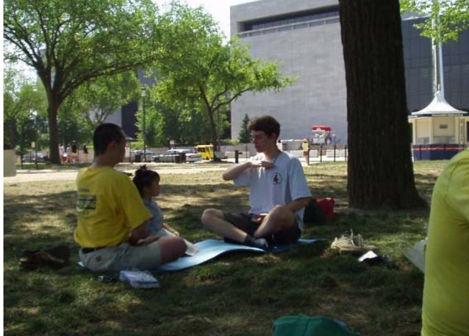
Figure 18: Teaching a new person the fifth exercise.