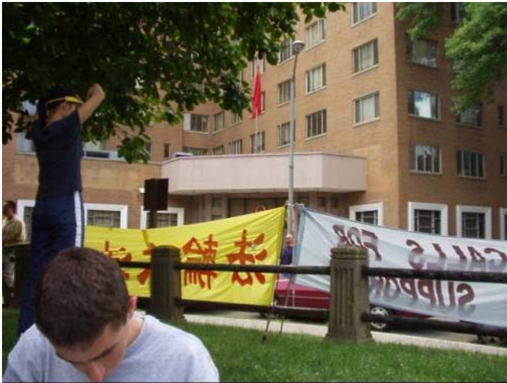
Figure 34: Practitioners in Front of the Chinese Embassy

Rose Farley, "Unlocking the Gong" [2001: 5]