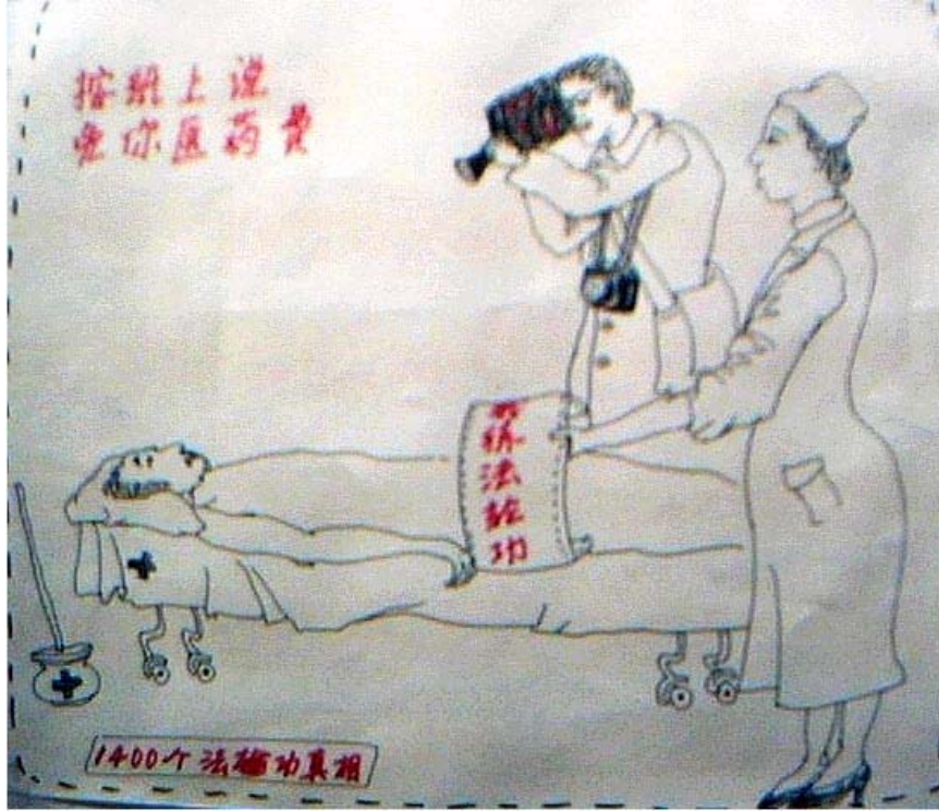
Figure 26: Clearwisdom.net refutes medical care allegation.

"Photographer: We will waive your medical bill if you say the words written on the paper." From http://www.clearwisdom.net/emh/articles/2001/12/18/16916.html . Used with permission.