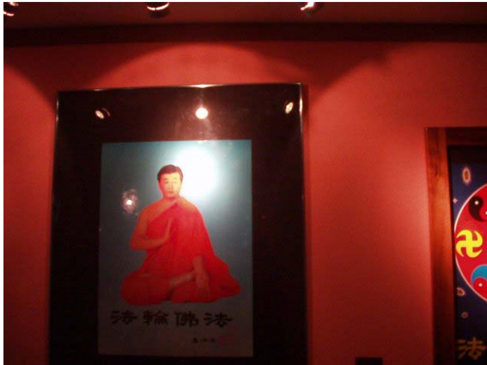
Figure 21: A picture of Li Hongzhi on Richard's wall

Indeed, there are images in both practitioners' homes that do not seem tied to specific events, but rather seem to just be a portrayal of Li Hongzhi's character. In his pictures, he also seems to embody tranquility, and, of course, Truthfulness, Compassion, and Forbearance. "In this new age of photography," Morgan writes, "when families, friends and lovers collected photographs of one another, it seemed only natural to treasure a portrait of one's best, most intimate Friend" (2002: 54).