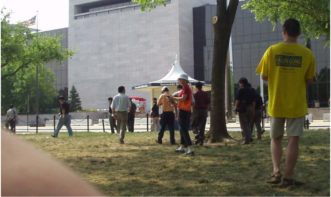
Figure 14: Chinese tourists walking away after taking pictures of practitioners up close.

As can be seen from the Table 5, the mean age of the D.C. practitioners was 35.18. Three practitioners were born in Taiwan, six were born in the United States, seven were born in China, and one was born in another Asian country. When asked why they moved to the D.C. area, all Taiwan and China-born practitioners mentioned moving to D.C. for reasons involving education or work, either their own or that of a spouse. The practitioner from the other Asian country moved to the United States with his family when he was only 3 years old because of the Vietnam War.