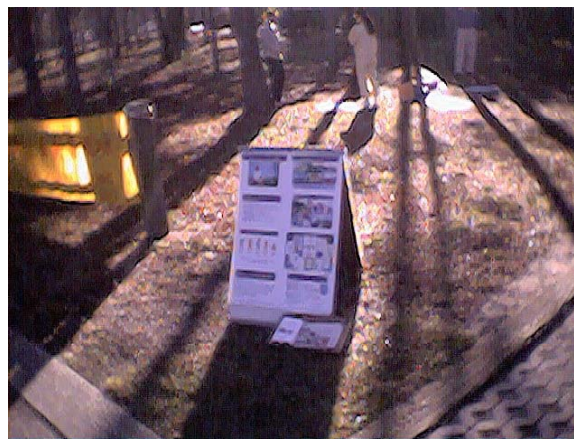
Figure 32: The poster used for the Practice Site in Tampa

As this newspaper article demonstrates, this strategy can be very effective in swaying opinions.