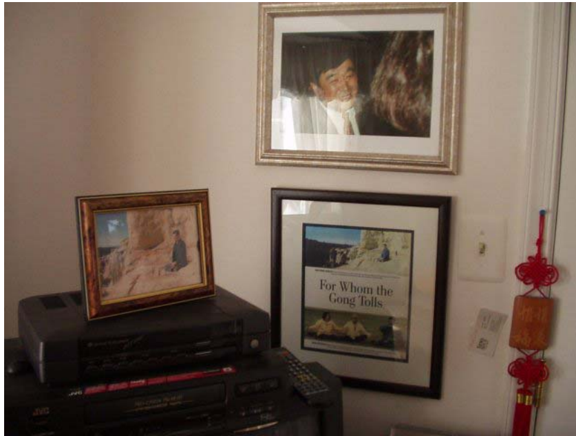
Figure 24: Nappi's wall and VCR