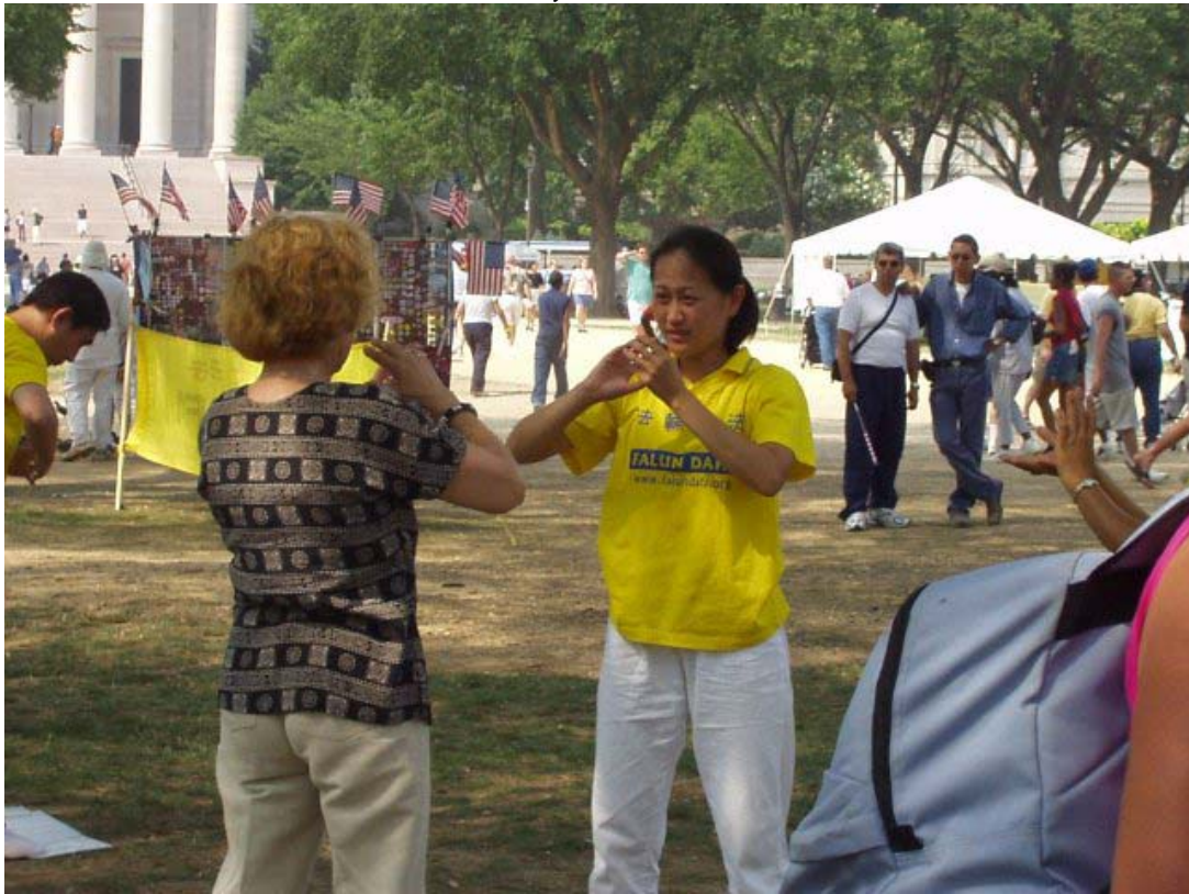
Figure 19: Teaching a new person the fourth exercise.

Photo by Noah Porter. Used with the permission of the practitioner pictured.