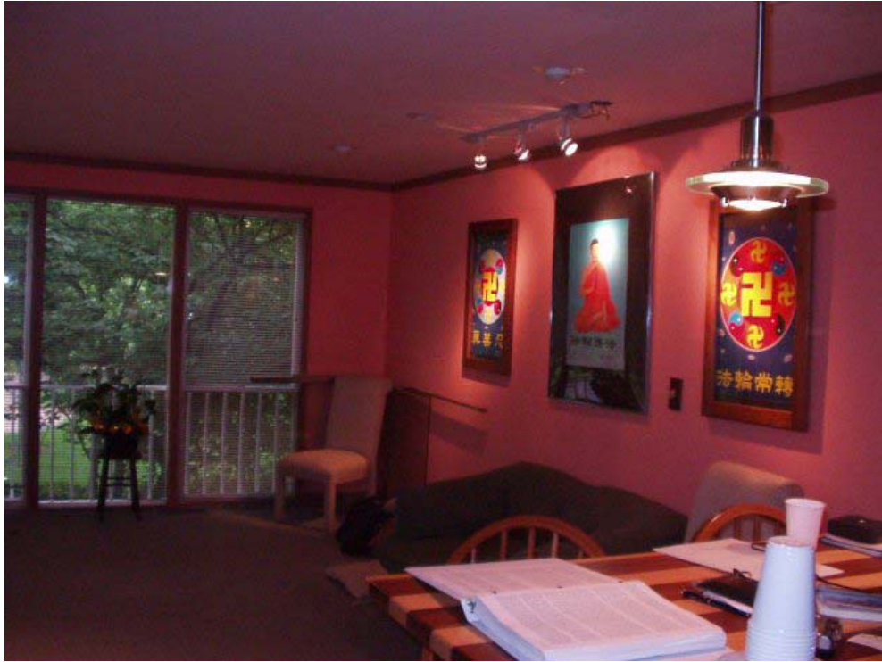
Figure 22: Richard's wall