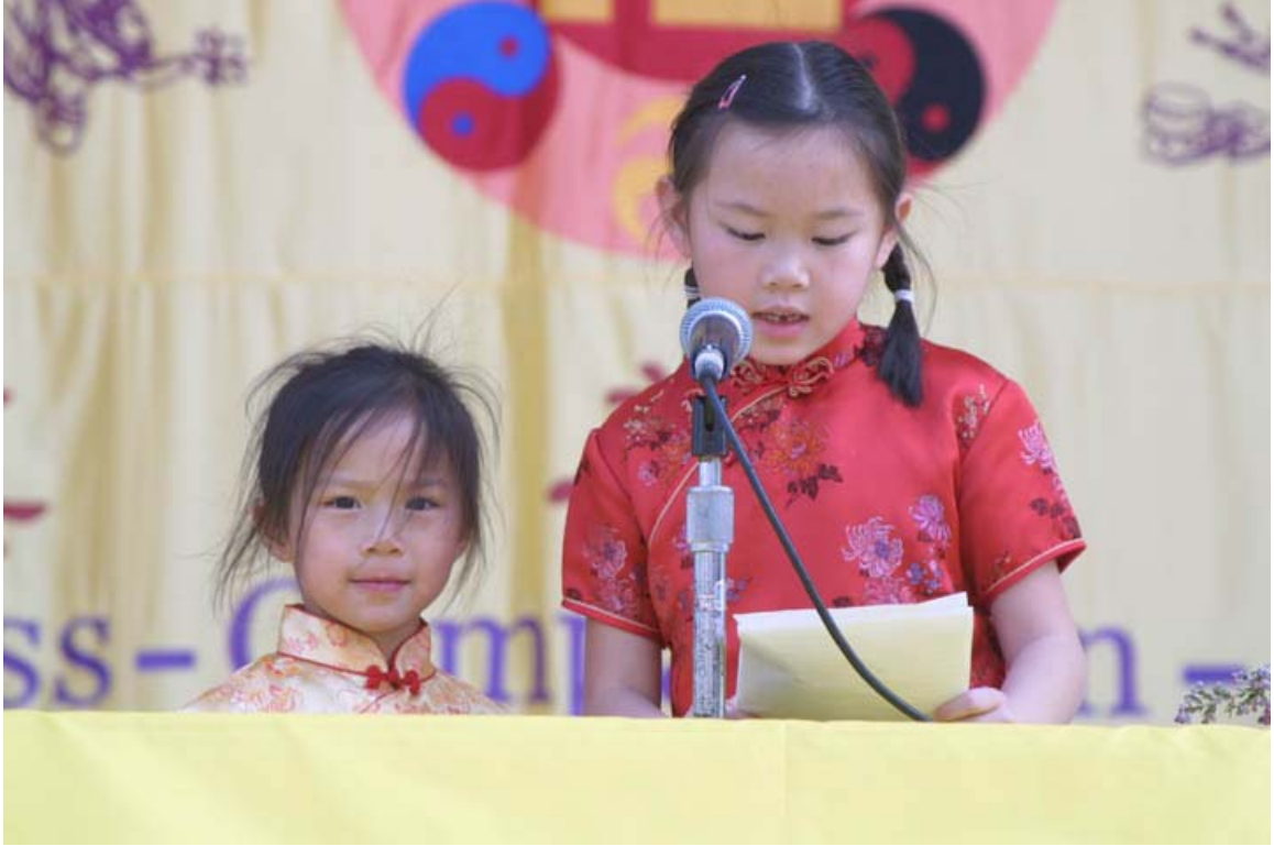
Figure 28: Children presenting at an Orlando experience sharing conference.