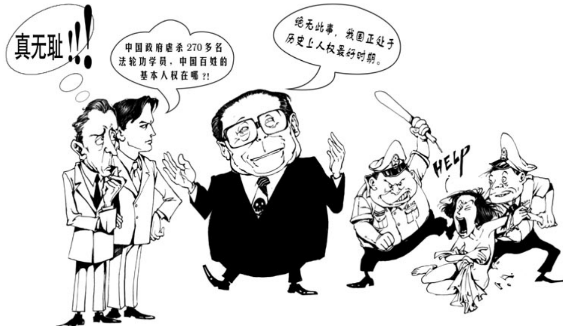
Figure 4: "Our country is in its best human rights period in history."

Available: http://www.clearwisdom.net/emh/articles/2001/9/5/13558.html . Used with permission.