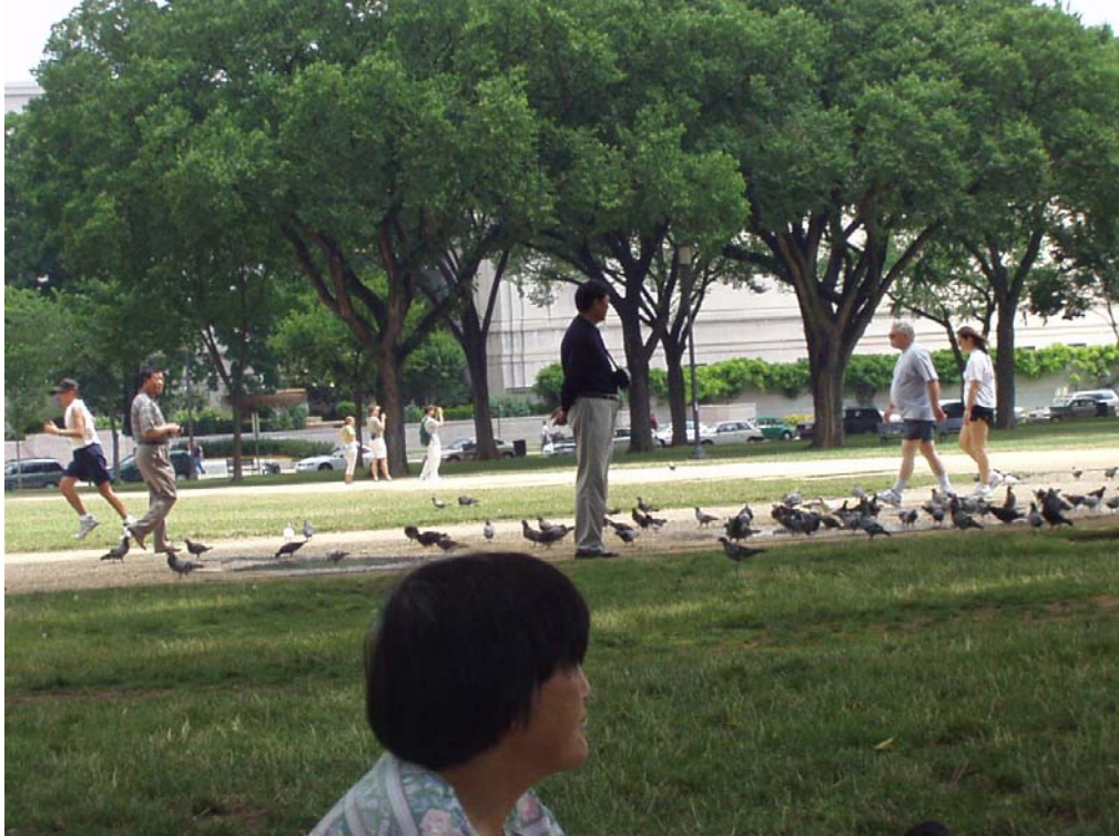
Figure 12: Suspicious-looking Chinese Man with a Camera Hangs Around the D.C. Practice Site