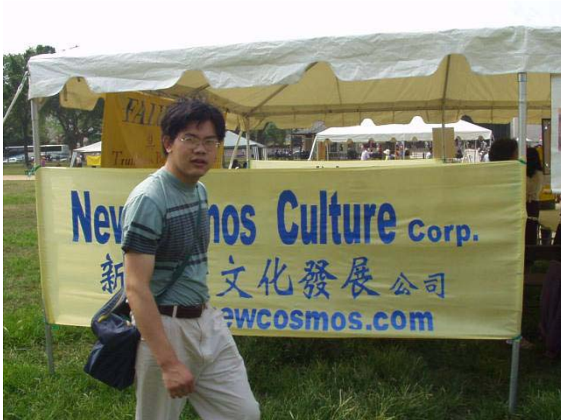
Figure 30: A New Website is Advertised at the D.C. Conference