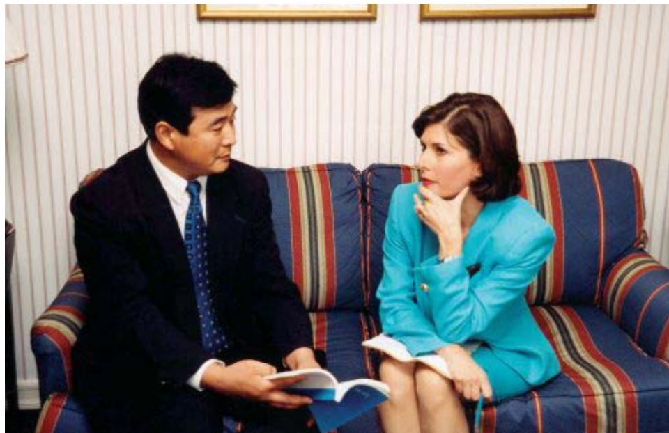
Figure 13: Li Hongzhi interviewed.

"CBS interviews Falun Dafa's founder, Mr. Li Hongzhi, the day after Chinese leader Jiang Zemin launches the persecution of Falun Dafa in China."