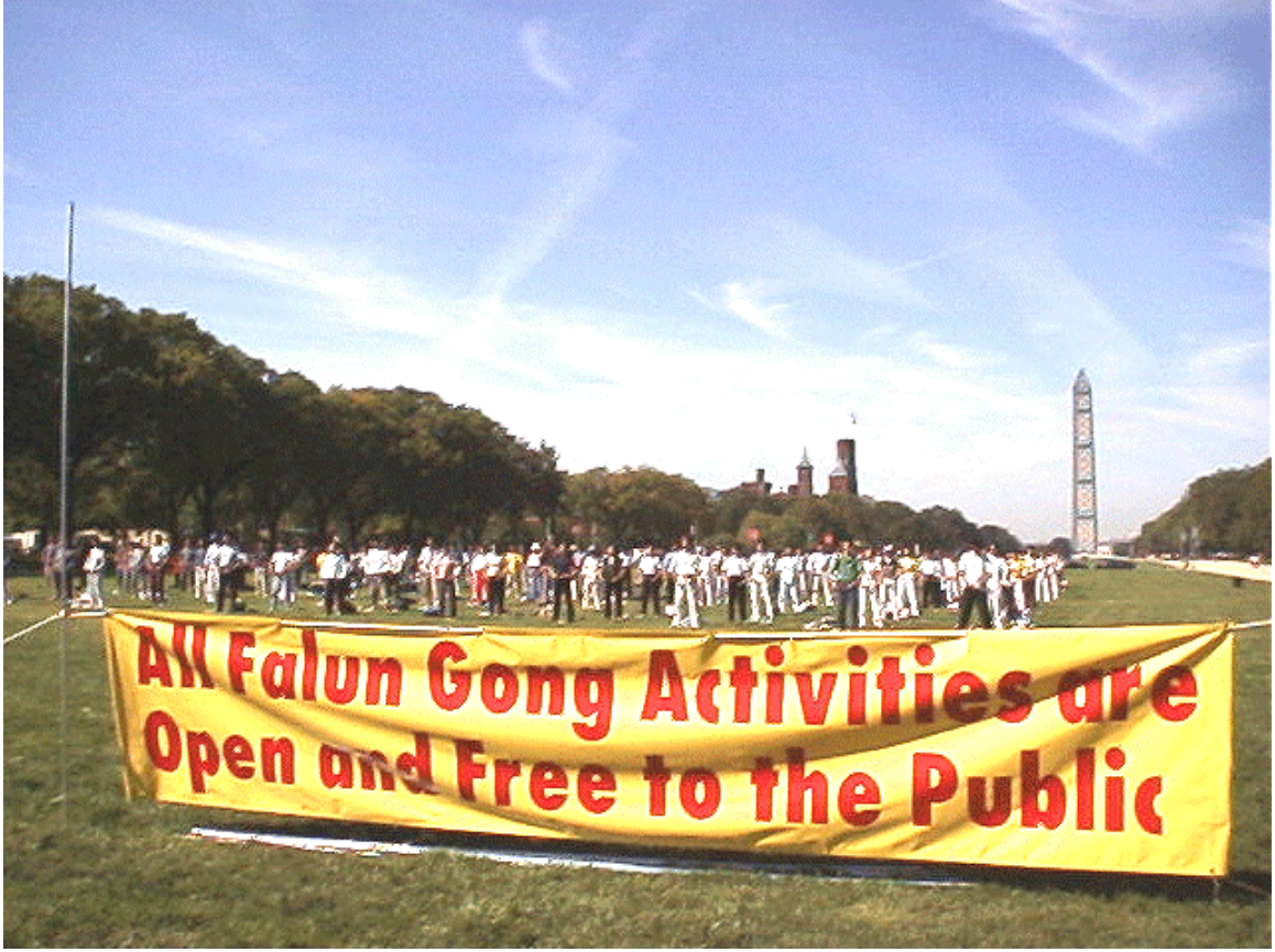
Figure 11: Practitioners in D.C..

Practitioners came from many different states for a conference in Washington D.C. on 10/1/99 to 10/3/99.