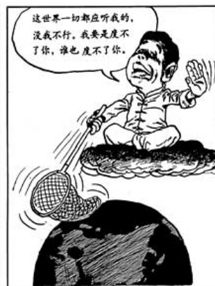
Figure 5: Part of an anti-Falun Gong comic.

Available: http://www.clearwisdom.net/emh/articles/2001/9/5/13558.html . Used with permission.