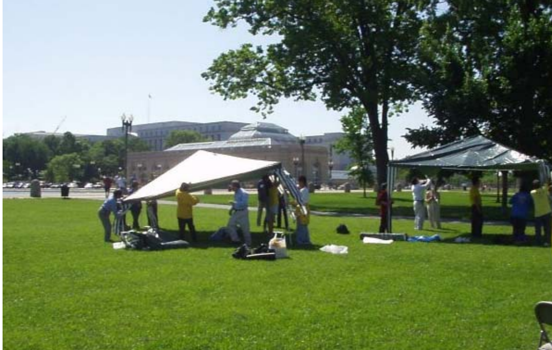
Figure 20: Practitioners setting up for Falun Dafa day.