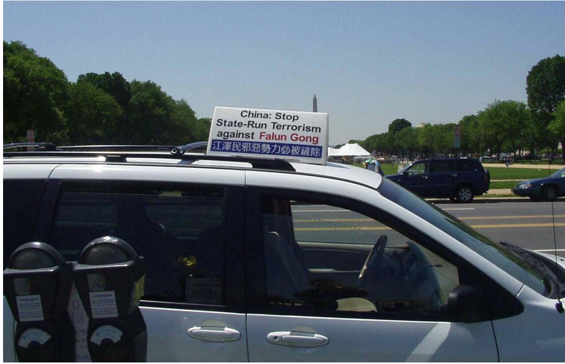
Figure 31: A Practitioner's Van In D.C. With A Message For China