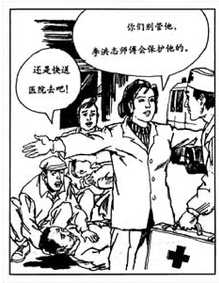
Figure 25: Medical care allegation in Chinese comic.

Another frame from "Li Hongzhi: The Man and His Evil Deeds" by the China Art Museum Press. This frame depicts a practitioner blocking medics, saying Li Hongzhi will cure him. Available: http://www2.kenyon.edu/depts/religion/fac/Adler/reln270/falungong/22.htm .