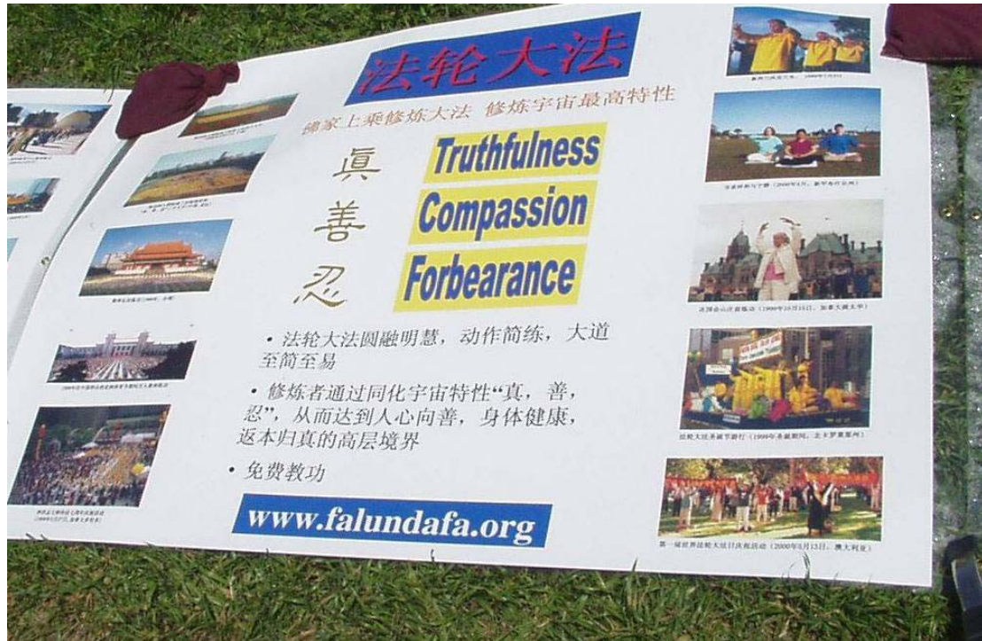
Figure 33: A Poster Used on the Mall in D.C.

stickers, and pamphlets, especially where the practice sites have many more practitioners so printing costs can be split with many more people. At the conferences, they often share these materials with practitioners in other areas who can take them back with them.