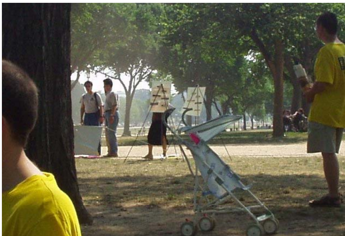
Figure 16: Passersby read Falun Gong posters