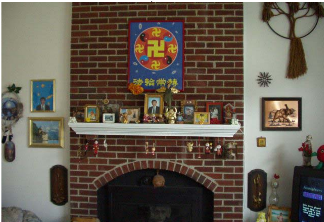
Figure 23: Nappi's fireplace mantle