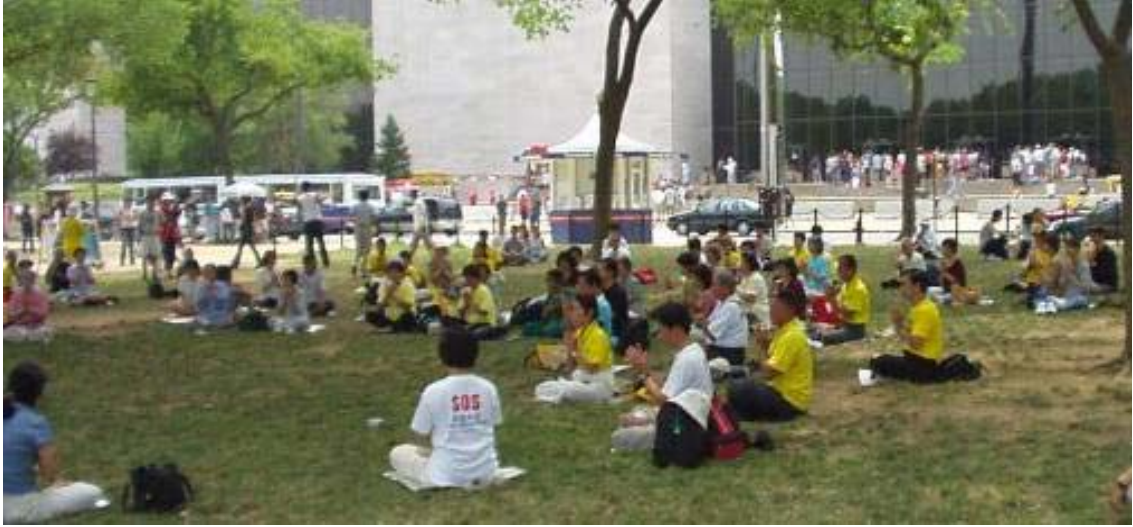
Figure 1: Practitioners in D.C. "Sending Forth Righteous Thoughts."

This ritual is believed to eliminate evil in other dimensions. One of my key informants compared it to prayer for Christians. It consists of hand gestures and reciting: "The Fa rectifies the Cosmos, the Evil is completely eliminated. The Fa rectifies Heaven and Earth, immediate retribution in this lifetime."