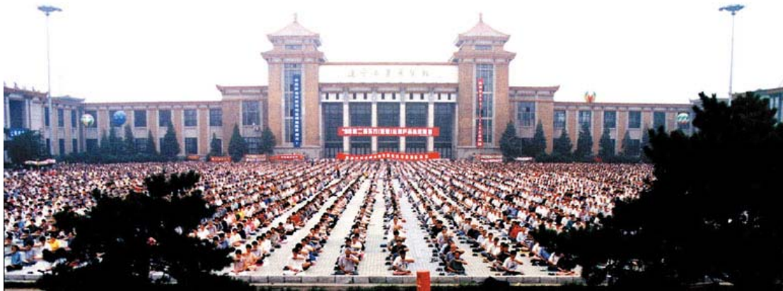
Figure 6: Practitioners in Sheng Yang

Available: http://falunorlando.org/gallery/china.html . Used with permission.