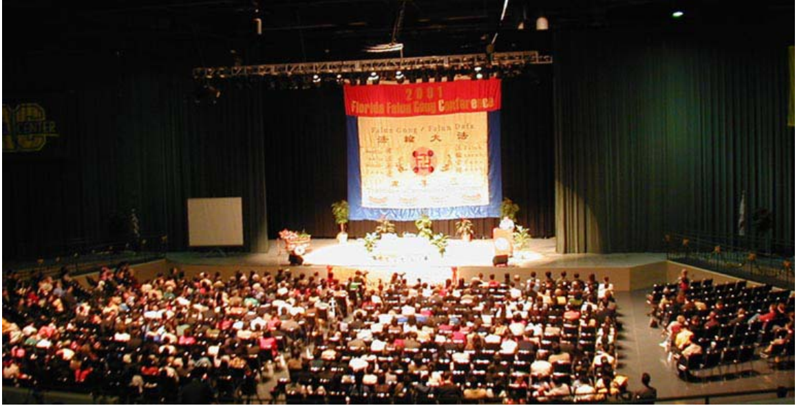
Figure 27: Conference at USF.

good of a practitioner the person is. Opinions can and do vary about each person, making the boundaries between practitioners and non-practitioners nebulous and fluid.