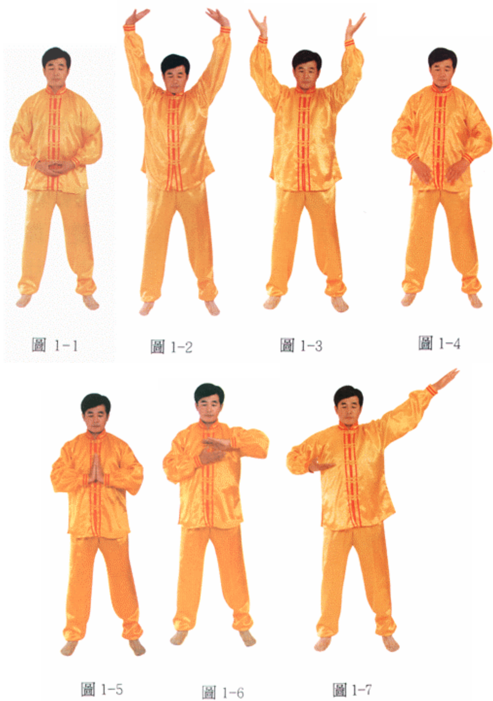
Figure 2: Part of the first exercise

This is the beginning of "Buddha Showing a Thousand Hands" performed by Li Hongzhi. From http://www.falundafa.org/book/eng/flg_4.htm#d1 .