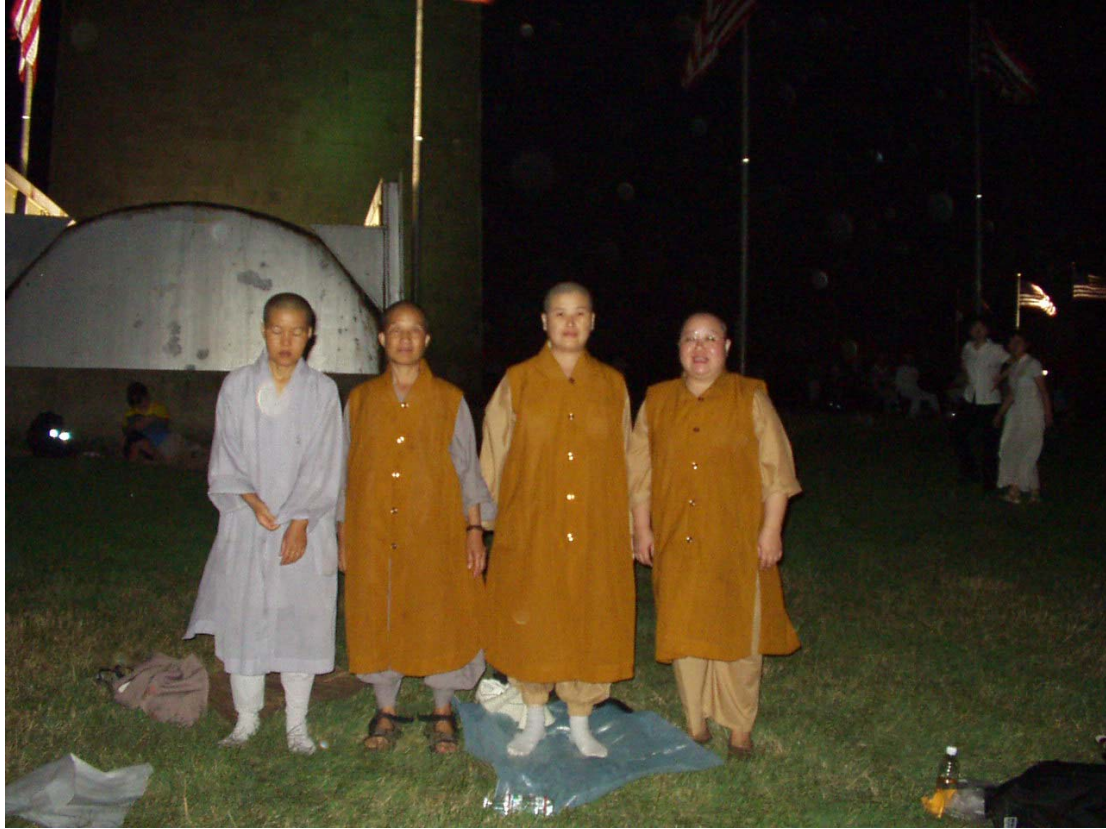
Figure 29: Professional Practitioners by the Washington Monument