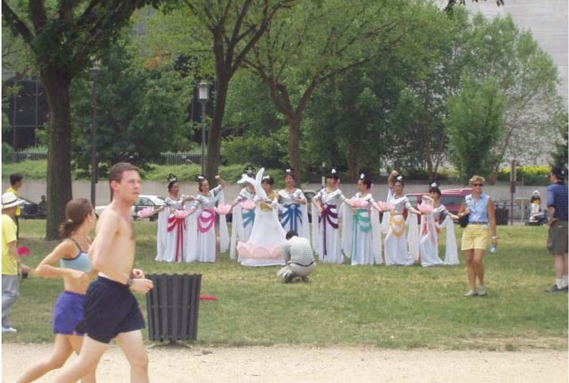
Figure 15: Joggers glance at dancers on Falun Dafa day.